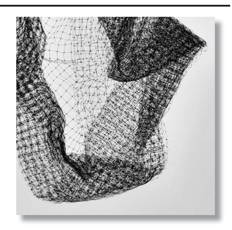
Fish Netting Kent Van Vuren